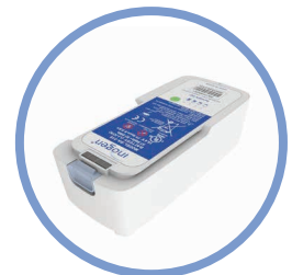
Inogen One® G5 Extended Life Lithium Ion Battery* Up to 13 hours run time Item #BA-516