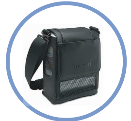
Inogen One G5 Carry Bag* Item #CA-500