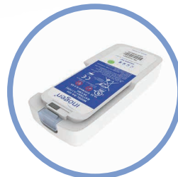
Inogen One G5 Lithium Ion Battery** Up to 6.5 hours run time Item #BA-500