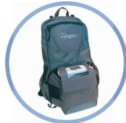
Inogen One G5 Backpack** Item #CA-550