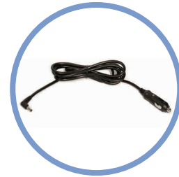
Inogen One G5 DC Power Cable* Item #BA-306